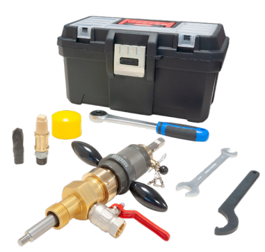
Hot tap drill - Economy model